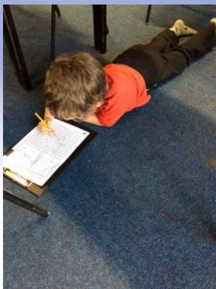
Imaginative writing in action

Literacy and English lessons this term have been focusing on improving our reading comprehension skills, using SHORS and developing our skills in imaginative writing; creating our own characters and developing a story about them.